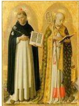
Figure 1: Saint Dominic