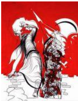
Figure 12: The death of Simon de Montfort, 1218

This reinforcement concerned de Montfort. He then seriously hesitated over the action to be taken in this siege. In addition, the lords who had reinforced the Host seemed now to have some doubts about the good of their action. Unquestionably, in their eyes, Count Raymond VI was within his legitimate right to want to defend his city. The city was defended with such passion, its inhabitants were devoted to their suzerain, their heroism and the military science made it increasingly difficult to see in this Crusade an offensive action against the forces of evil that had been the purpose at the beginnings of the Albigensian Crusade. Simon de Montfort had to act quickly and decided to attack on the following day, 24 June, 1218, at dawn.