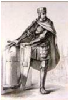
Figure 3: Simon IV of Montfort

Trencavel was thrown into a dungeon of its own city within the Pinte tower and there, officially, died of dysentery on 10 November, 1209. However, many believed that he was in fact assassinated by Simon de Montfort. Trencavel, because of his youth (24 years) and his heroic resistance faced with Crusader armies, even represented at the bottom of his cell, a symbol for resistance to the invaders.