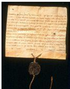
Figure 5: Bull of Innocent III

The following day, the Crusaders attacked all the defences and pushed the defenders to negotiate their surrender. The price of their defeat was to hand over to de Montfort the 300 Toulousains that had come to help defend the town. None were spared. In spite of the promises of de Montfort to allow surrender, the monastery was never the less plundered by the Crusaders.