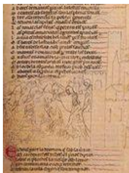
Figure 11: The Siege of Toulouse

The fortifications having been raised to the ground to some extent by de Montfort, the city felt dangerously vulnerable. The inhabitants therefore undertook to build new walls as quickly as possible: using the external streets as ramparts and setting fire to certain houses within the immediate surroundings of the Narbonnese castle in order to shelter archers and artilleryists. The task was such that every inhabitant was called to duty – Count, knights, the middle-classes, merchants, men, women, children and the old.