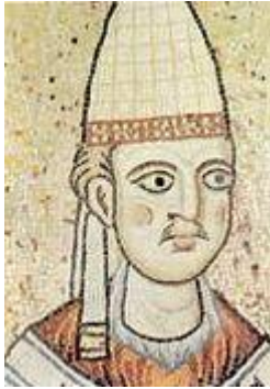
Figure 7: Innocent III