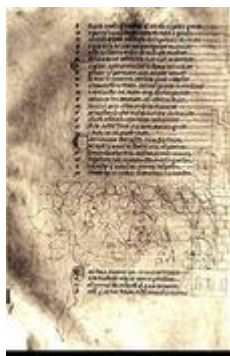
Figure 4: The Battle of Montgey, 1211

Simon de Montfort turned towards Castres and Lombers then which, having been handed over spontaneously in 1209 rebelled for a few months and were suddenly given up during the summer of 1210 again.