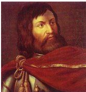
Figure 6: Simon IV de Montfort

The Crusaders were reduced by the departure of approximately forty knights. Having heard rumours of the preparations of Pedro II, the leaders of the Crusade, Simon de Montfort and Arnaud Amaury, chose to negotiate with the King of Aragon. Pedro II was not impressed by the decision of the Council of Lavaur and was prepared to enter the war against the Host. The negotiations were short and the Aragonese army crossed the Pyrenees with weapons and supplies.