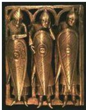
Figure 9: Simon de Montfort