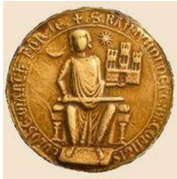
Figure 10: The seal of Raymond VII

The role of Bishop Foulques remains prone to controversy. What was the role he really played in entrapping the Toulousains? Here opinions diverge: some remember his ousting of the manu militari of the city in 1211 and it is possible to consider his role to be a question of revenge for his share of Toulouse.