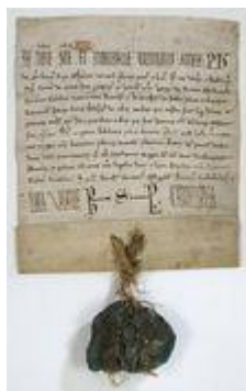
Figure 8: Homage of de Montfort to the King of France

The entry of de Montfort into the city keep was a real trauma for Toulousains, who, after six years of resistance were seen at the mercy of their worst enemy. De Montfort required that the walls of the city be demolished, the fortified houses be raised to their foundations and that the towers be brought down. Only the Narbonnese castle escaped from the destruction. The forty days passed and Prince Louis left again for Paris. It is quite strange, this participation in the Crusade of the son of the King, who had so much to fear and had, in the end, been successful in giving little to the military or political planning of the Crusade.